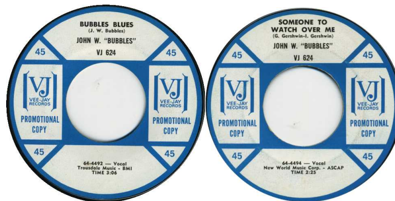
John W. Bubbles – promo single

John W. Bubbles LP (John William Sublett - February 19, 1902 – May 18, 1986)