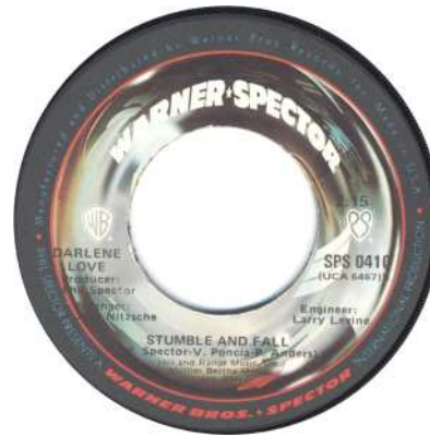
“Stumble and Fall” 1977 reissue