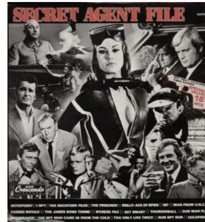
The original release and the 1984 re-issue of the album