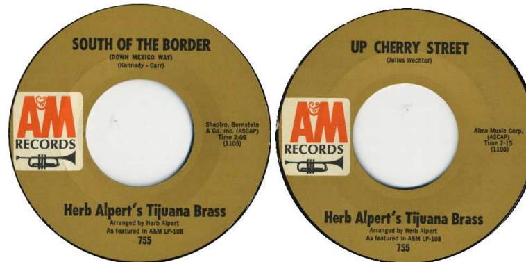
Leon is supposed to be on “South of the border”, but you can't hear him!

1028 Alpert's, Herb Tijuana Brass South of the border/Up Cherry Street A&M 755 (US) 1964 Leon is supposed to play piano on “South of the border”, but he is not audible. No piano on track 2.