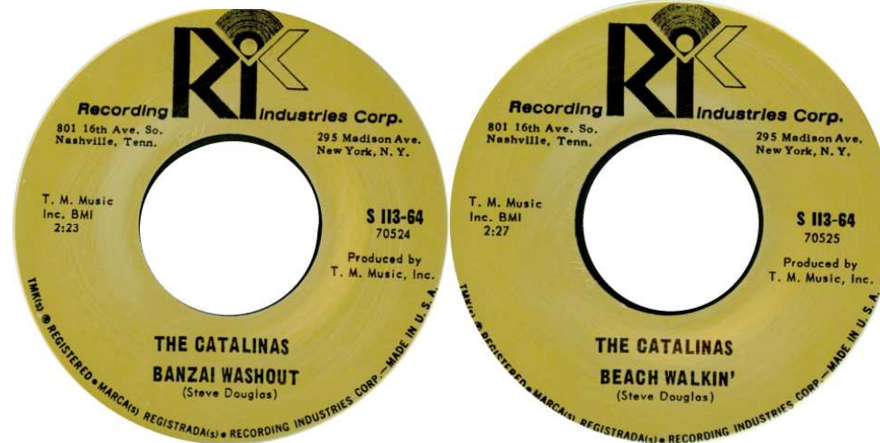
662 The Catalinas Banzai Washout/Beach Walkin'

Recording Industries Corp. S 113-64 (US) 1964