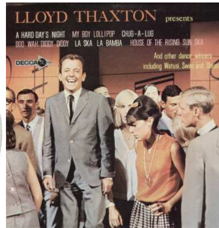
White label promotinal copy