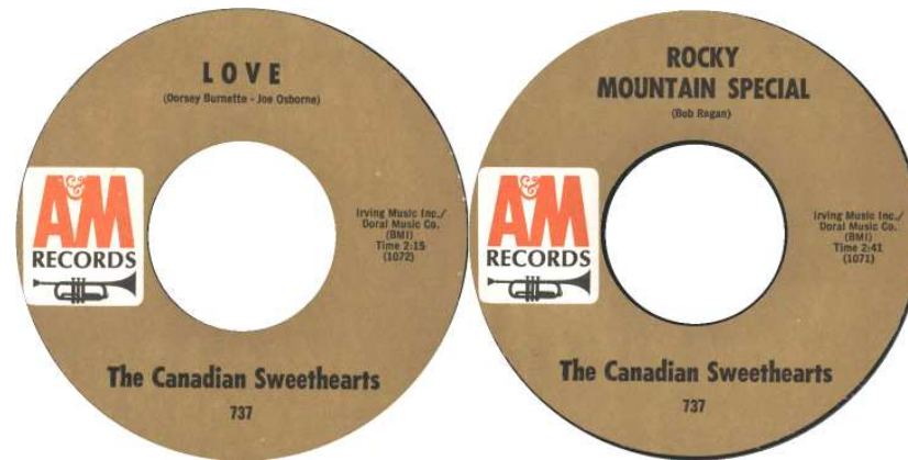
1281 Canadian Sweethearts Love/Rocky Mountain Special A&M 737 (US) 1964 Lots of piano on 1, but no piano on 2

Steve Alaimo – single – of “Where the action is” fame as host.