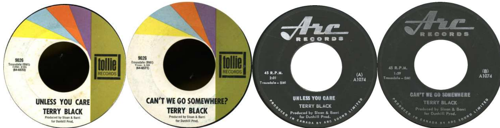
US and Canadian issue