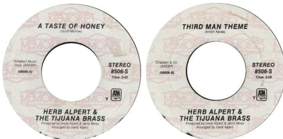
and from the reissue-series “Memories” (A taste of honey)