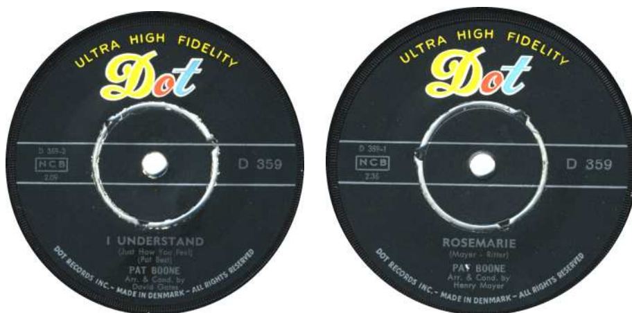
Danish release with picture cover