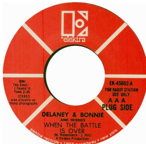
Single – sided – For radio station use only

1512 Delaney & Bonnie When the Battle is over (single sided) Elektra EK 45662 (US) 1969