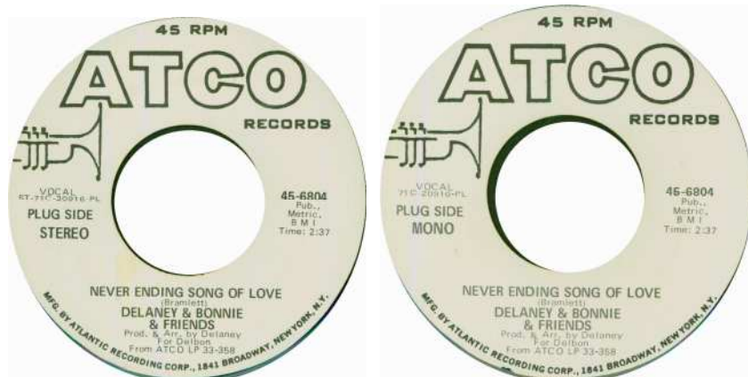
Promotional release with stereo and mono side – both short version – no Leon