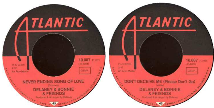
German release both are the “short” versions