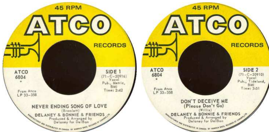
Canadian release with a little intro before the piano goes on