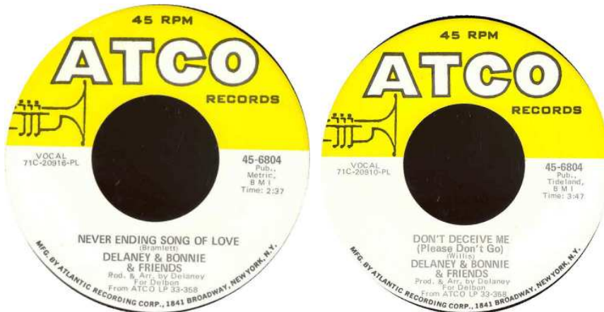
US release with both tracks shortened a few seconds in the beginning