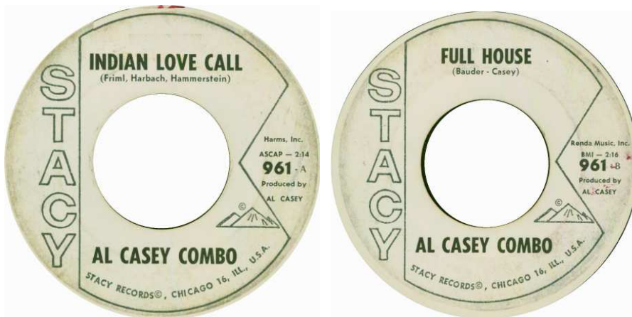
1091 Casey, Al (Combo) Indian Love Call/Full House Stacey 961 (US) 1963 Wh. lab. promo - organ on both but No LR