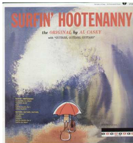
The original album plays barely 25 min. The reissue on Sundazed plays 31 min. due to 3 alt. takes.