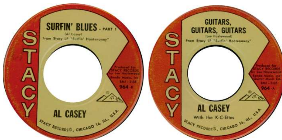
1113 Casey, Al Surfin' Blues part I/Guitars Guitars Guitars Stacey 964 (US) 1963 593 Casey, Al Surfin' Hootenanny Sundazed LP 5026 (US) 1996 CD Casey, Al Surfin' Hootenanny Sundazed SC 6114 (US) 1996