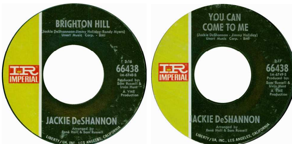
1214 DeShannon, Jackie Brighton Hill/You Can Come to Me Imperial 66438 (US)

Track 1: Lots of piano, but not Leon - Track 2: Lots of piano, but it does not sound like Leon.