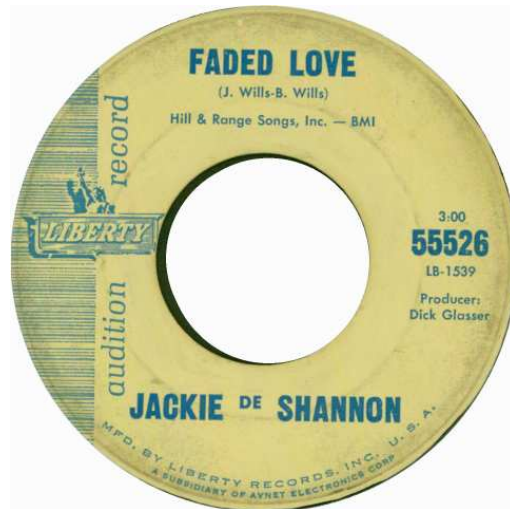
Audition record – same track on both sides

1332 DeShannon, Jackie Faded love/Faded Love Liberty 55526 (US) 26.12.1962