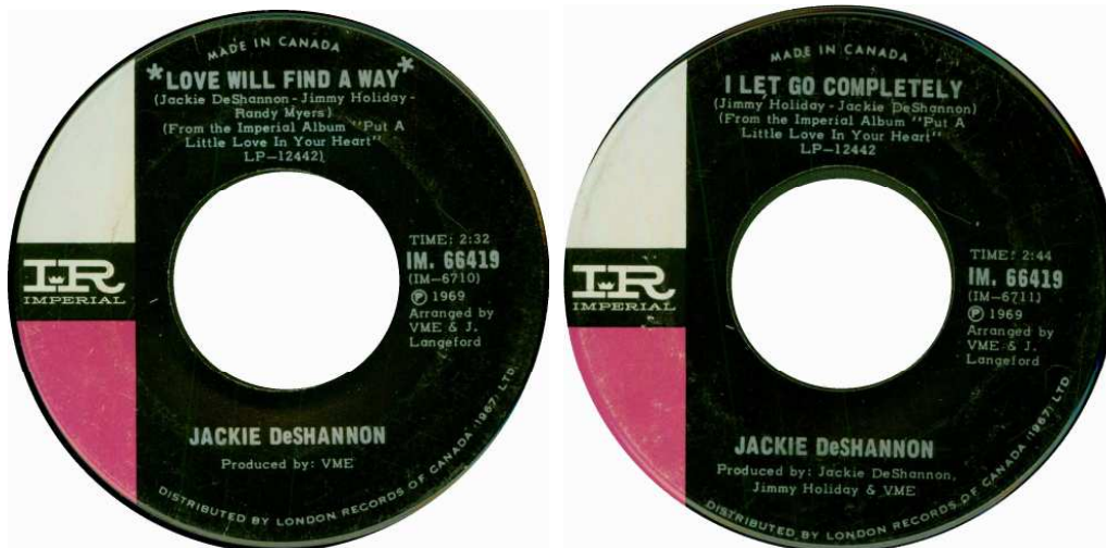
1096 DeShannon, Jackie Love Will Find a Way/I Let Go Completely Imperial IM 66419 (CAN)

Track 1: Lots of piano, but not Leon - Track 2: Lots of piano, but it does not sound like Leon.