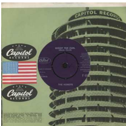
and a German company cover