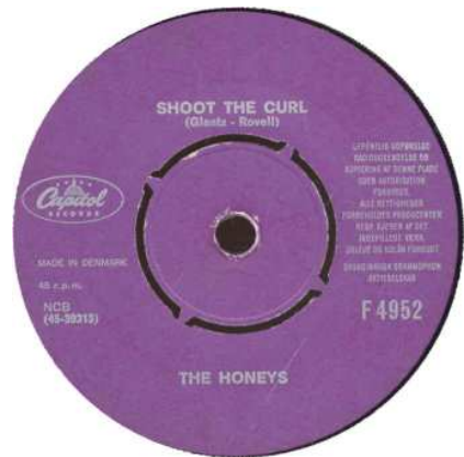
The record is made in Denmark

0351 Honeys Surfin' Down the Swanee River/ Shoot the Curl Capitol F 4952 (DEN) 4.1963