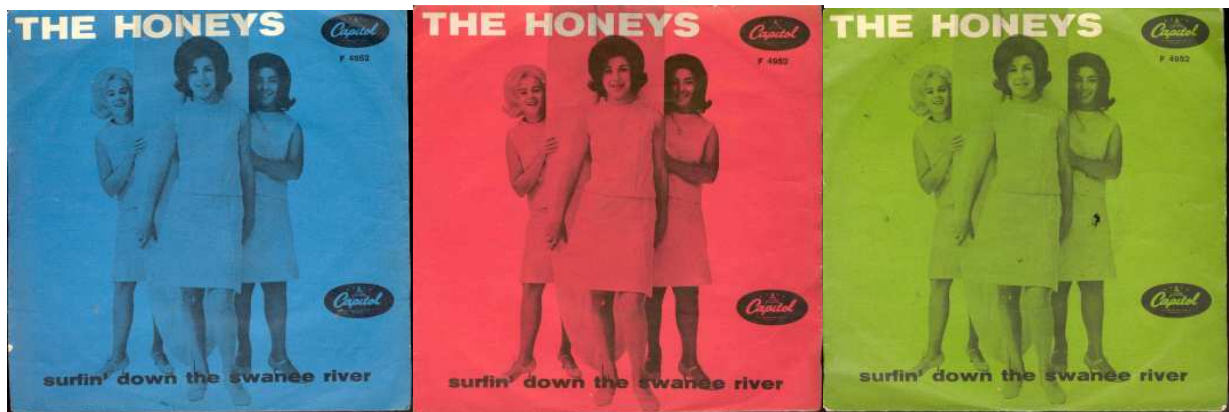
Danish release, but printed in Sweden. I think that there is a yellow cover too.