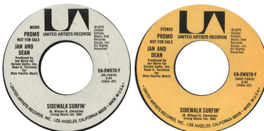
Promotional record from 1975 – mono - stereo