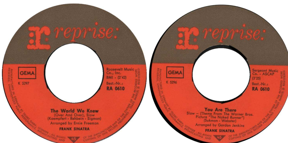
B-side is the theme from the movie "The Naked Runner"

1473 Sinatra, Frank The World we knew/You are there Reprise RA 0610 (D) 29.06.1967